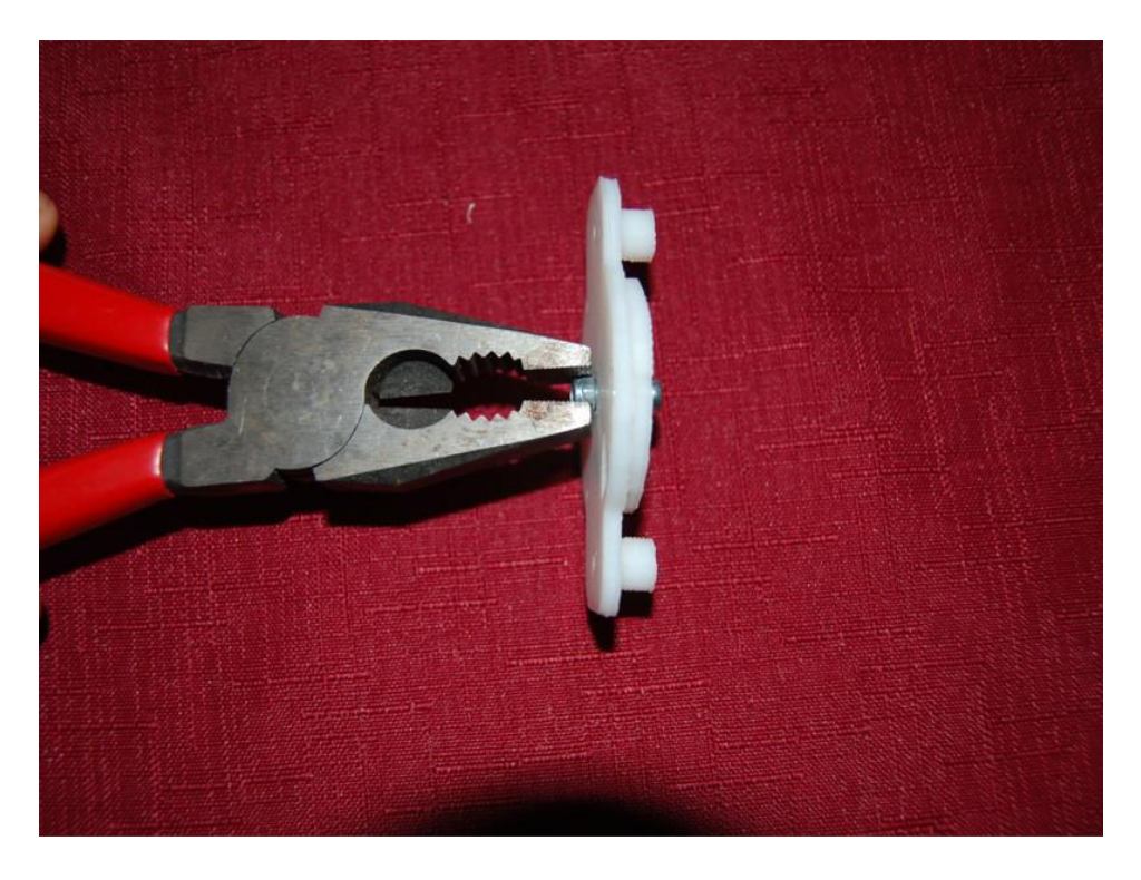
Feed PCB cable through cable exit duct on dome base. Use M3 bolt and plastic washers to fasten PCB to dome base.