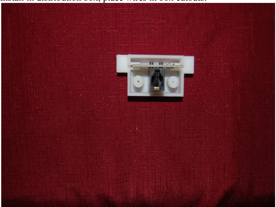
Fit box top and fasten with 2 x #4 x 19mm self tap screws:

Install in distribution box, place wires in box cutouts: